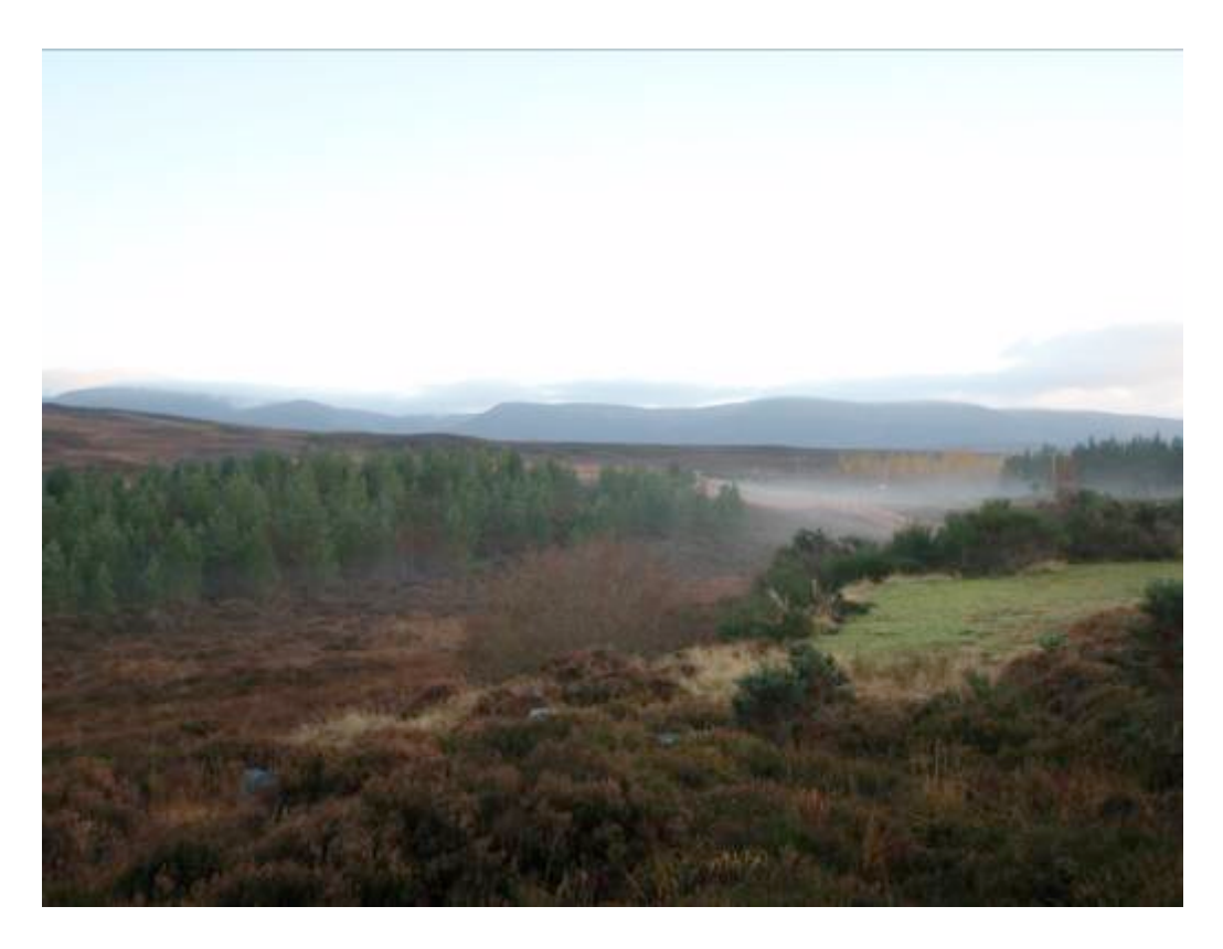
Fig. 2 – Site of proposed house

1. This application is for Planning Permission in Principle for the erection of a shooting lodge and access road on land 2300m south of Pipers croft, Catlodge. The application site is within recently planted pine woodland northeast of the A889 on Cathar Mor, which is designated as an Area of Great Landscape Value (AGLV). Access to the site would be taken off the A889 trunk road. The development proposal is based on a land management justification for a shooting lodge which is discussed later in the report.