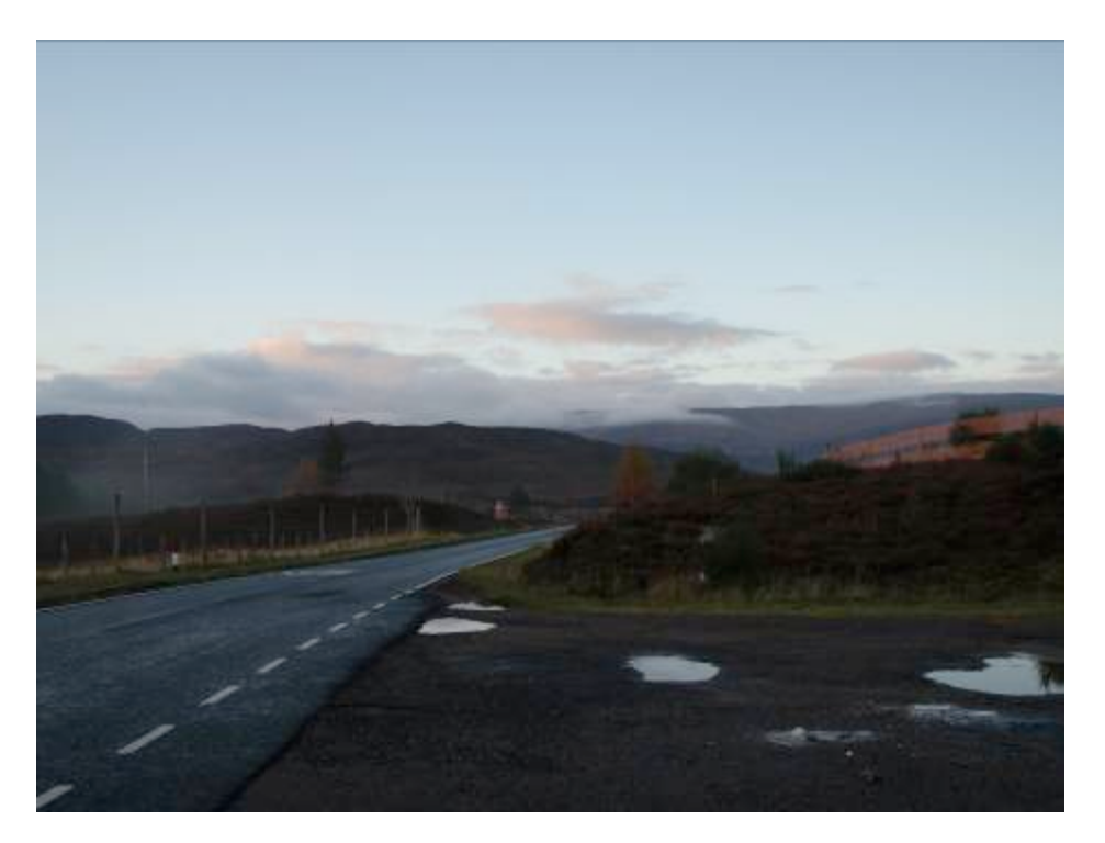
Fig. 3 – Access to the site